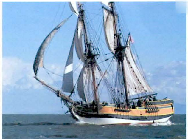
Lady Washington is one of the many ships that will participate in the Tacoma Tall Ships Festival in July.